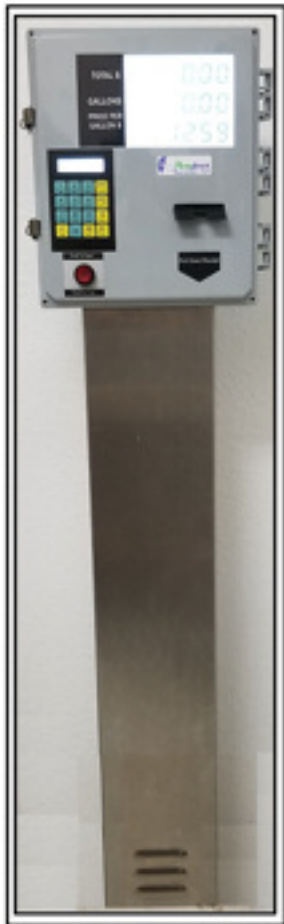
P4-050-2 Electronic Register External Pedestal Mount

The ParaSCALE system is the most advanced means of safely controlling cylinder filling to prevent overfilling, while ensuring the customer receives a complete fill. Available as a stand alone unit to connect to any electronic load-cell scale base, as a package with the scale base with or without flow control solenoid, or fully integrated into the P4-050 Electronic scale, offering ALL of the options, capabilities, communications and convenience of a Parafour Autogas dispenser, in a UL495 Listed, NTEP certified package, the ParaSCALE system is in a class by itself. It may be installed in a typical dispensing cabinet, with remote power supply, or externally on a pedestal.