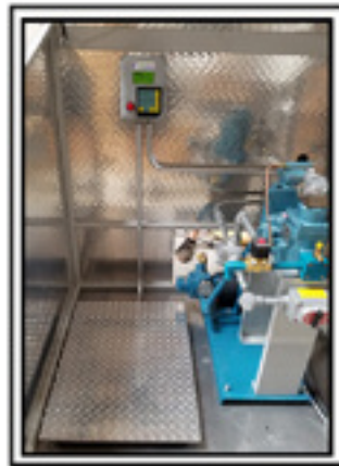
ParaSCALE in GEC Cabinet Dispenser

Integrated with the P4-050-2 Electronic register, the Parascale can also facilitate options such as: