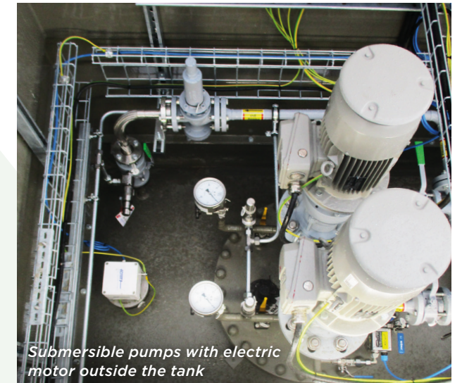
Submersible pumps with electric motor outside the tank