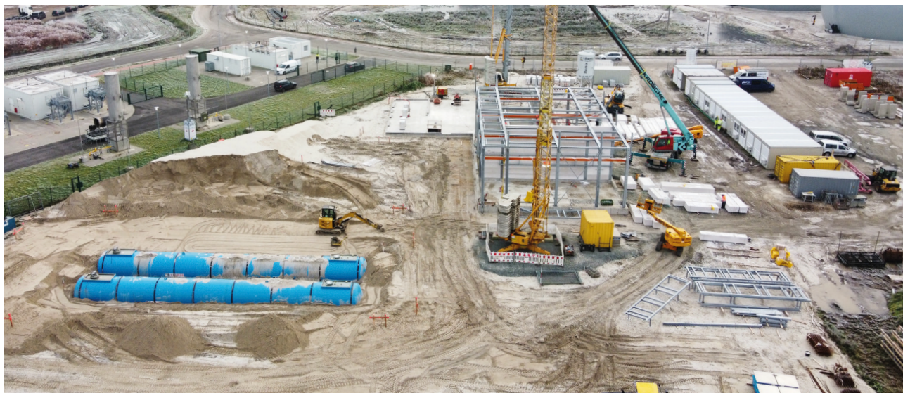
Approximately 50 systems built or delivered in the last 15 years.

For years, biogas plants have focused on generating electricity, but a changing energy landscape has pushed many biogas producers away from electricity production to explore new revenue streams. One of these is producing gas for the national grids. There's just one problem: the biogas doesn't have the necessary calorific value to meet the strict gas grid standards. This means that it needs to be enriched with propane (a key component of LPG) before it can be accepted into the grid – a process that requires the right equipment.