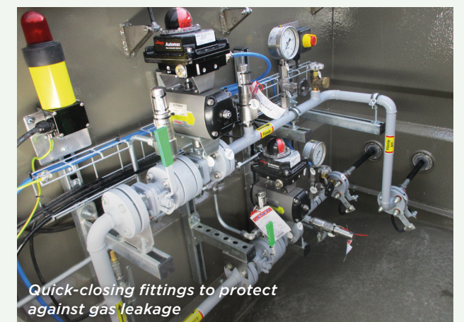
Quick-closing fittings to protect against gas leakage