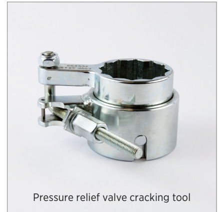
Pressure relief valve cracking tool

To ensure complete safety throughout the valve exchange, we strongly recommend that you follow up with the SafeSwap (also made by MAKEEN Gas Equipment) to protect against accidental valve ejections.