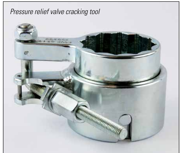
Pressure relief valve cracking tool

To ensure complete safety throughout the valve exchange, we strongly recommend that you follow up with the SafeSwap (also made by KC ProSupply) to protect against accidental valve ejections.